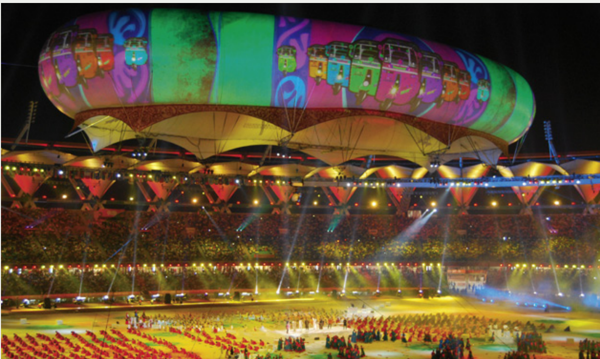
Giant images were projected onto the huge helium balloon with Dataton WATCHOUT™ multi-display software.