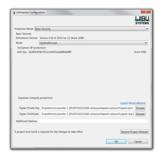
Figure 2: AES encryption and signature configuration

Security Profile and its secure run-time loader are a software-only solution for applications with a low-to-medium level of security criticality. For security-critical applications, Security Profile can be enhanced and seamlessly integrated with Wibu-Systems' CodeMeter® hardware-based solution that has been tested and validated for interoperability.